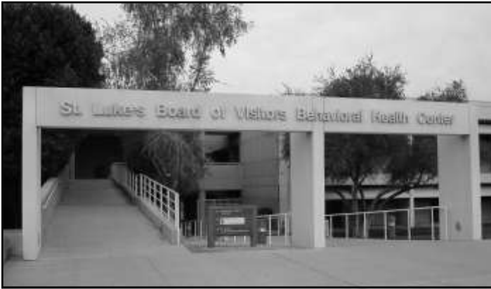
The St. Luke's Board of Visitors Behavioral Health Center was dedicated in 1981.