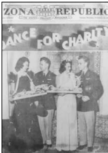
1942 Charity Ball