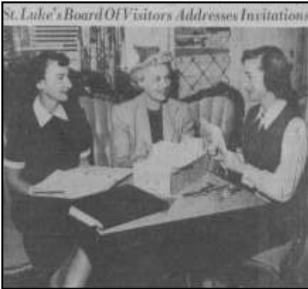
"Three prominent Phoenix matrons address invitations for the annual St. Luke's Charity Ball." Arizona Republic 1950

raising drive and in 1954, hospital staff and volunteers dedicated a new sixty-bed addition. St. Luke's celebrated its Golden Anniversary in 1957, opening a new diagnostic center for heart and lung disorders.