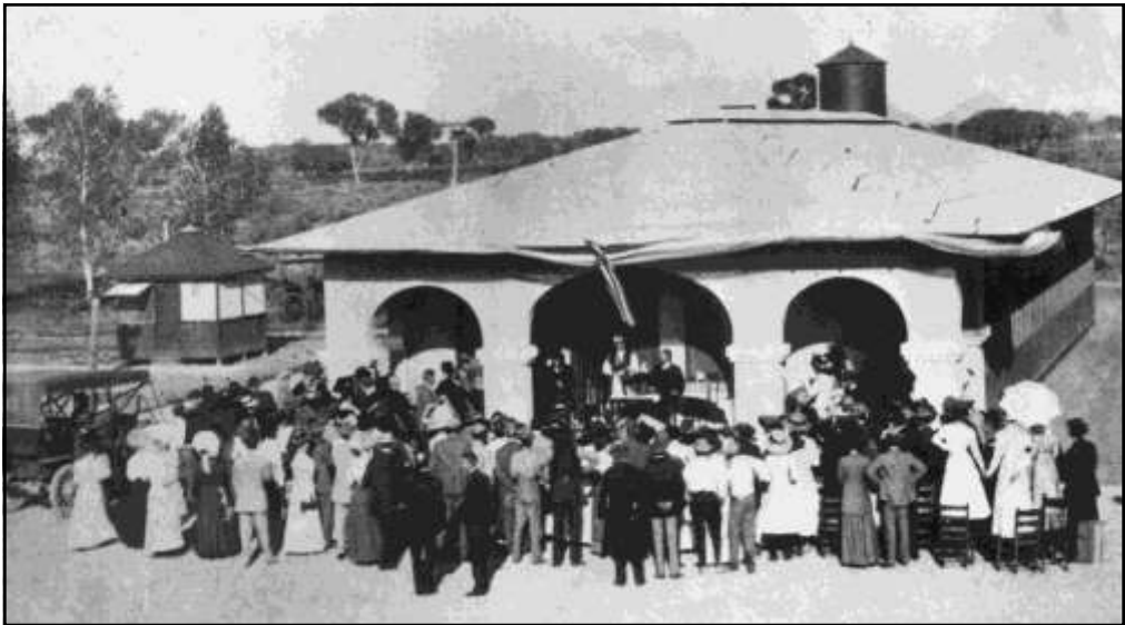
Dedication of St. Luke's Home