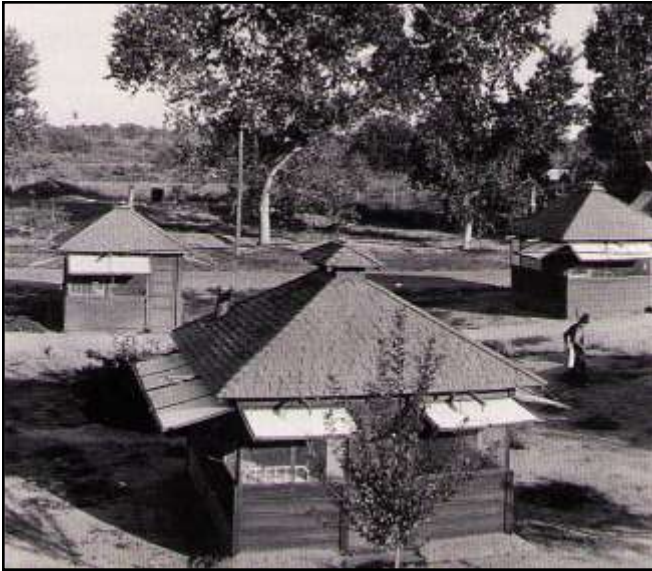
The grounds at St. Luke's Home