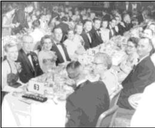
1954 Charity Ball Hotel Westward Ho

library and entertainment. Board of Visitors members discussed these requests but did not change their activities until 1953 when the Hospitality Committee became the Hospitality and Patients' Service Committee with the following subcommittees: Emergency Patients' Services, Tray Service, Clothing Service, Religious Services, Purchasing, Occupational Therapy, Flowers for Altar and Special Occasions, and Christmas for Patients' Children.