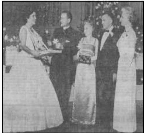
1954 Charity Ball