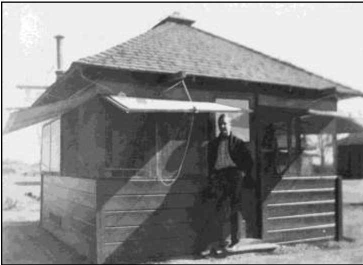
A TB patient stands in front of his cottage circa 1915.