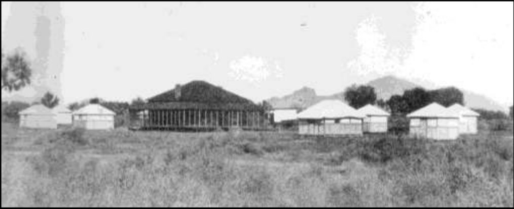
St. Luke's Home circa 1908

Salt River Valley, advertised as a place to recover from respiratory diseases, became known as a “lungers’ mecca.”